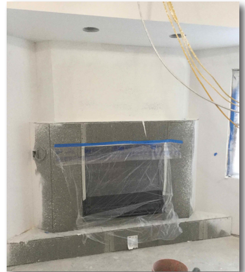
The hearth is prepared and ready to receive its mantel piece and stone veneer.