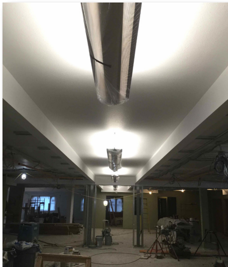
The main hallway is now painted and lighting is installed. The view is looking from the new West addition to the front entrance.