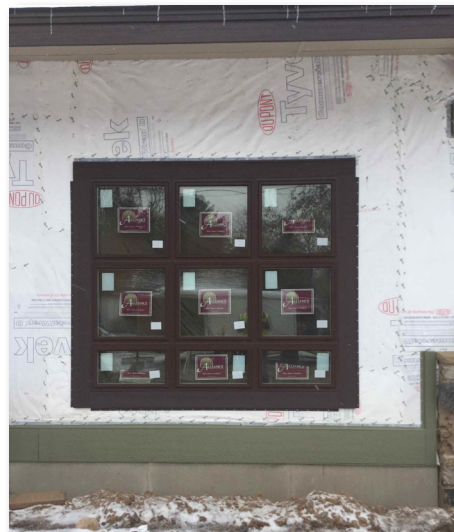
Exterior view showing trim installed around the South side windows. The color selection for the trim is chocolate by Diamond Kote.