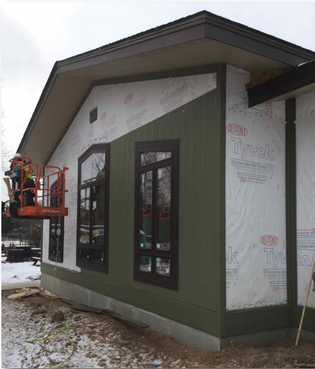
Siding panels are installed on the South side of the new addition. The color selected by the Library for the LP Smart Side is Olive from Diamond Kote.