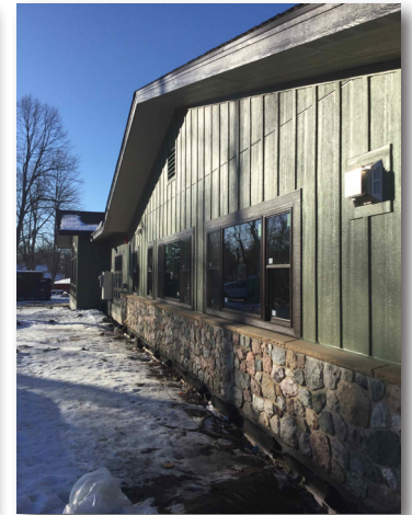
South exterior is nearly complete. The batten boards have been installed to give the final appearance.