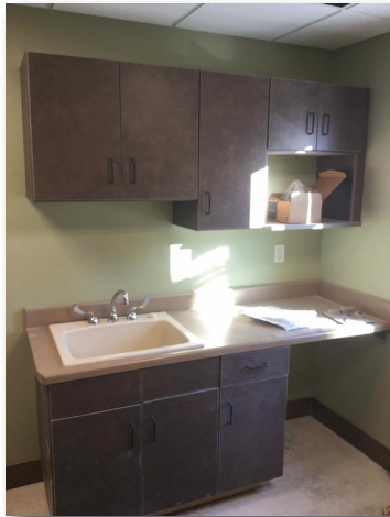
Cabinetry and plumbing fixtures have been installed.