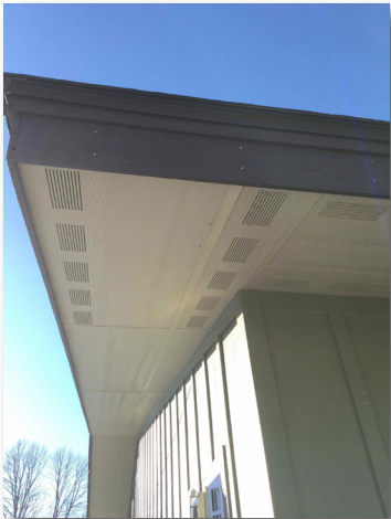
View of the double vented soffit (Southeast corner).