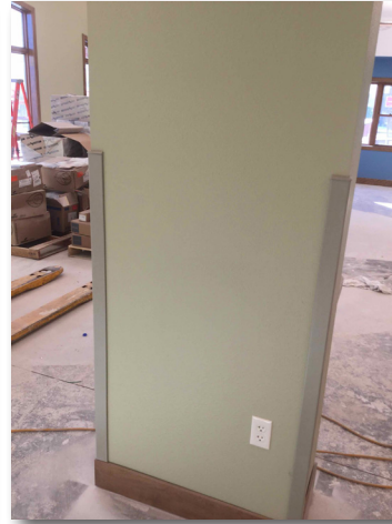
Olive colored corner guards.