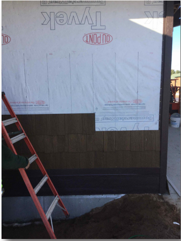
LP cedar shakes are installed on the East addition.