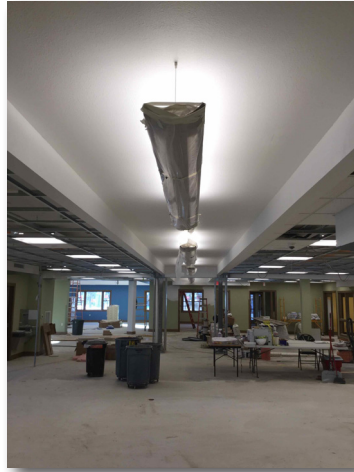
Updated view of the main entrance hallway.